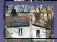
Very Poor Upkeep