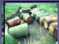
Very Poor Upkeep