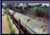
Very Poor Upkeep